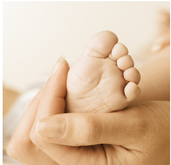
From the beginning, created in the image of God